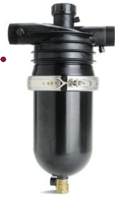
2" Super Filter

X = Standard, O = Optional, - = Not Available